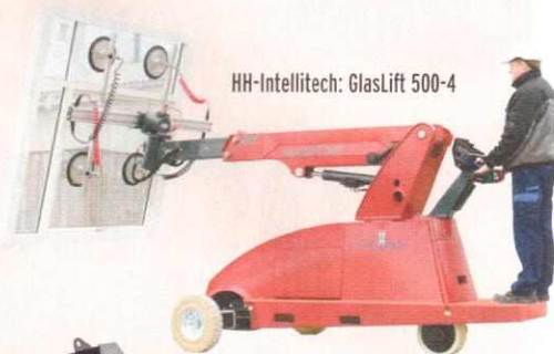
HH-Intellitech: GlasLift 500-4

To book your place at the awards dinner, contact the ERA ( www.erarental.org )