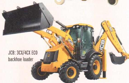
JCB: 3CX/4CX ECO backhoe loader