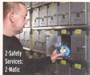
Z-Safety Services: Z-Matic