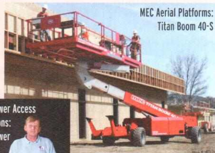
MEC Aerial Platforms: Titan Boom 40-S